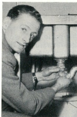
★Tom Finney the footballer at work in Preston store.