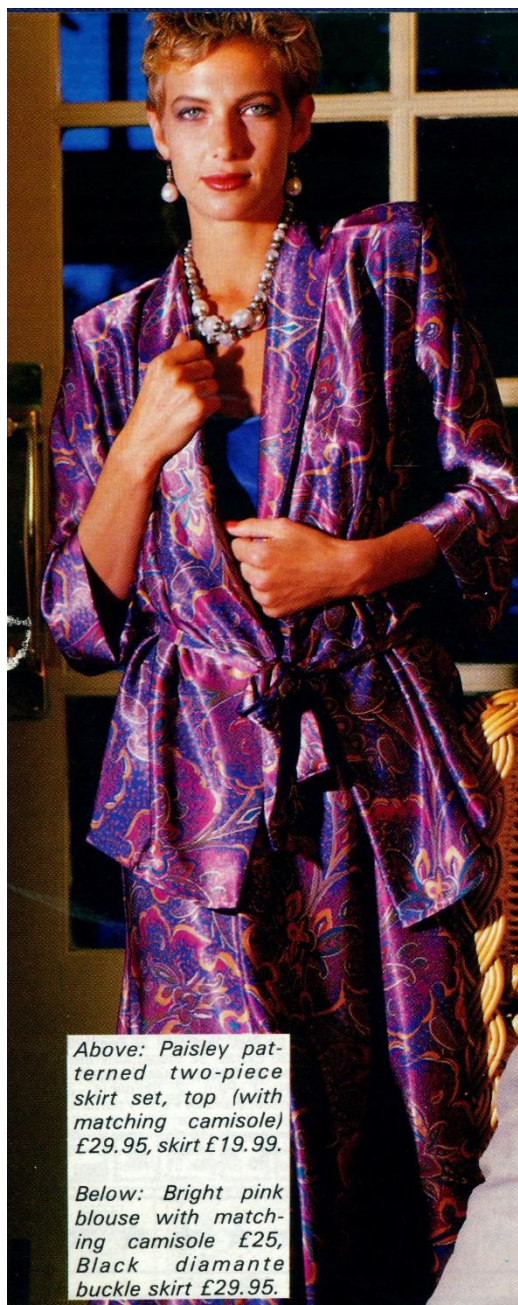
Above: Paisley patterned two-piece skirt set, top (with matching camisole) £29.95, skirt £19.99.