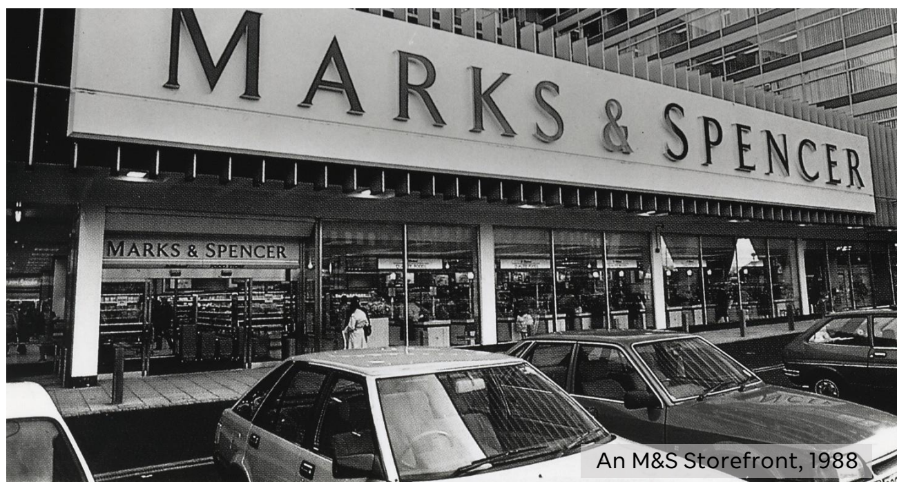
An M&S Storefront, 1988

14-16 Have a Go – 1980s themed activities for you to try