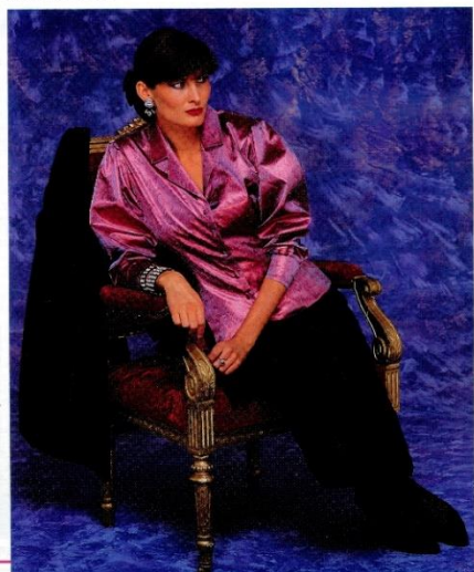
Below MOIRE — watermark shiny pink blouse, £35, crinkle velvet jacket and skirt, £65 and £35. Selected stores.